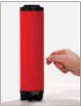
A pin point size hole here will rupture an elements media.

Many filter housings are fitted with so called "Differential Pressure Gauges". Generally, these are indicators and not precise gauges which offer no level of calibration or accuracy. Typically these will show an area of green and red, indicating that if the needle is in the green, the element does not require changing. Differential pressure gauges are neither filter service indicators nor air quality indicators; they simply measure differential pressure and offer an indication only of premature blockage.